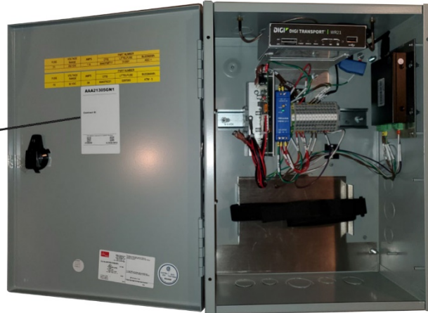
Otis ONE Plus Video/Voice Top-of-Car Box (AAA21305GP)