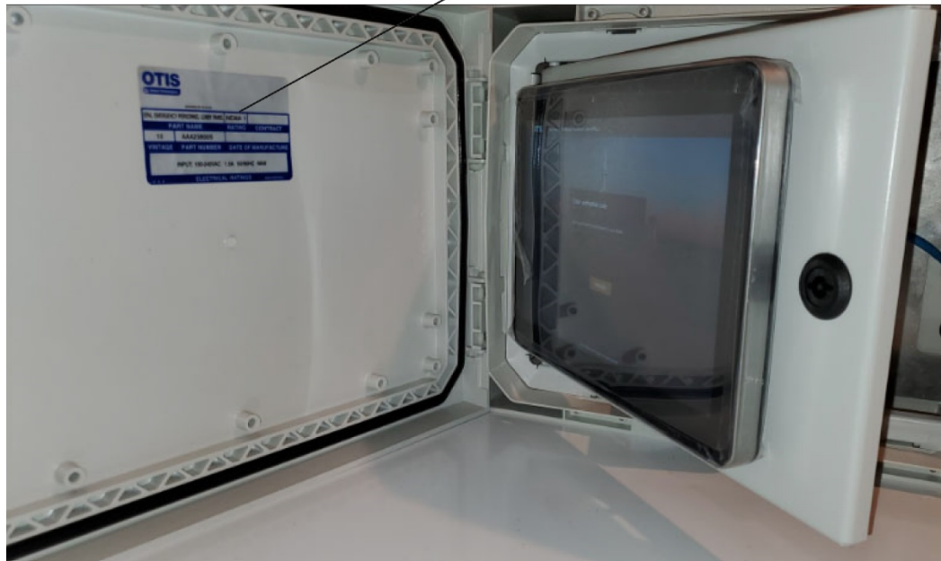
ePAL Emergency Personnel Lobby Panel